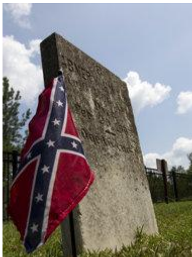
A Confederate flag graces a soldiers grave stone in Cemetery