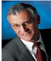
Col. Steve Strobridge, USAF-Ret., Dir. MOAA Government Relations

MOAA asks you use their suggested message at http://capwiz.com/moaa/issues/alert/?alertid=51440506&PROCESS=Take+Action to urge your elected officials to avoid options like the chained CPI that disproportionately affect those who already have sacrificed the most for their country. If you prefer you can use the NCOA Action alert provided letter at http://capwiz.com/ncoausa/issues/alert/?alertid=52258501&queueid=[capwiz:queue_id] [Source: MOAA Leg Up Steve Strobridge article 15 Jul 2011 ++