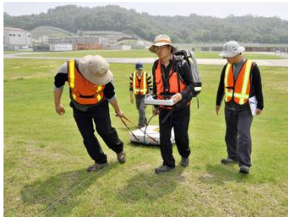
South Korean technicians conduct a ground-penetrating radar survey at Camp Carroll, a U.S. base in Waegwan, South Korea, to search for drums of Agent Orange possibly buried there.

Agent Orange Korea Update 05: Using such modern tools as ground-penetrating radar and conducting analyses of water and soil core samples, a team of investigators in South Korea is searching for clues to a decades-old mystery: Did American soldiers dispose of the defoliant Agent Orange at a U.S.-run base about 150 miles southeast of Seoul in 1978? For weeks, a U.S.-South Korean survey team has focused on a helipad site at the Camp Carroll base. Recently, tiny amounts of a toxic element found in Agent Orange were discovered in three nearby streams. But South Korean officials say the amount of dioxin is too small to cause health problems such as cancer or birth defects and has not yet been connected to the alleged burial of drums containing Agent Orange at the base. U.S. officials say they have no evidence or records of Agent Orange ever being kept at the base. The investigation was launched after a U.S. veteran told a Phoenix television station in May that he and others buried dozens of drums containing Agent Orange at Camp Carroll more than three decades ago. "We're taking the claim very seriously," said U.S. Army Col. Joseph F. Birchmeier, an engineer and co-chairman of the joint investigative team. "Our focus is on the health and safety of U.S. soldiers and their families at Camp Carroll and of residents around the base." [Source: Los Angeles Times John M. Glionna article 21 Jul 2011 ++]